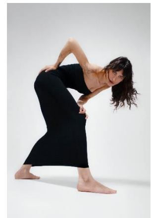
Dress by Wolford made with ROICA™ V550

- Wolford , the market leader for luxury Skinwear, is recognized for developing exquisite fabrics and top-notch innovations, meeting the highest environmental and sustainability standards in the textile industry. Wolford understands sustainable luxury is a new brand ingredient and are dedicated to expanding their collections each season and infusing responsible materials. The shirts and tops from the innovative Aurora Line, for example, were created thanks to the partnership and collaboration with ROICA™ and its premium degradable stretch yarn ROICA™ V550 belonging to the ROICA Eco-Smart™ family , the world's first elastane yarn awarded Cradle2Cradle Material Health Gold Level Certificate and Hohenstein Environment compatibility certification, which provides evidence of compliance and offers confidence as a responsible choice.