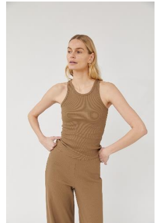
The Slow Label rib tank and pants containing ROICA™

- The Slow Label , a company guided by its values in every decision it makes. Its aim is to slow down the fast-paced fashion industry by approaching things with an honest and improvement-oriented mindset. The capsule collections consist of garments that are timeless and versatile — two key factors in making clothing more sustainable and creating long-lasting positive change. Many of their products are made with organic cotton and ROICA™ V550 , such as classic rib tank tops and rib pants, but also t-shirts and sweatshirts.