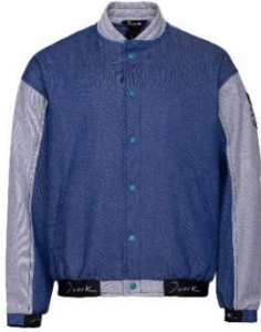
Denim jacket by Duarte made with ROICA™ EF

- Duarte , a sustainable streetwear brand from Portugal, created and led by visionary designer Ana Duarte. It focuses on mixing and creating different textures essentially through the use of unique prints, natural and technological fabrics, and knitwear. The pieces are all about the details, quality finishes, good materials and are always made with Sustainability in mind. Giving a colourful and positive energy to everyday life, Duarte pieces are perfect for someone with an active lifestyle that values garments with design and an urban appeal, while contributing for a better world. In the collection presented at White Milano as the C.L.A.S.S. Icon 2021 Award winner, a long-panelled unisex coat and trousers are made with ReLAST®, a responsible textile manufactured by ROICA™ partner