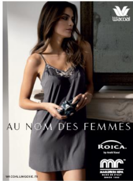
Nightgown by Wacoal made with ROICA™