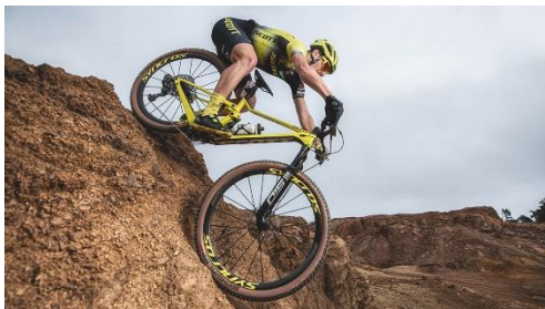
Scott Racing Team uniform with ROICA™ EF